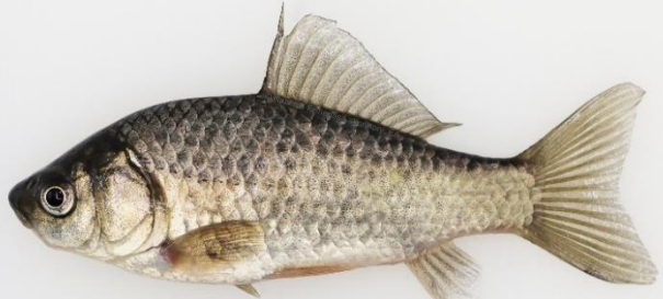
Nigorobuna (Carassius auratus grandoculis)